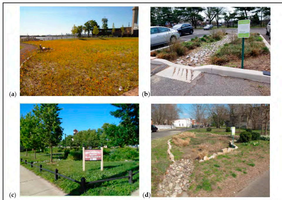
Figure 2. Photos of sample GSI projects in Waterfront South (specific locations marked on map in Figure 1): (a) a wildflower meadow in Phoenix Park; (b) a small rain garden in a publicly owned parking lot; (c) a pocket park comprising several rain gardens and vegetated areas; (d) a rain garden in a publicly owned vacant lot.